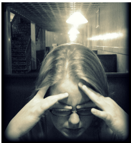
Foto: BLW Photography http://creativecommons.org/licenses/by/2.0/

What do you think could be reactions to stress?